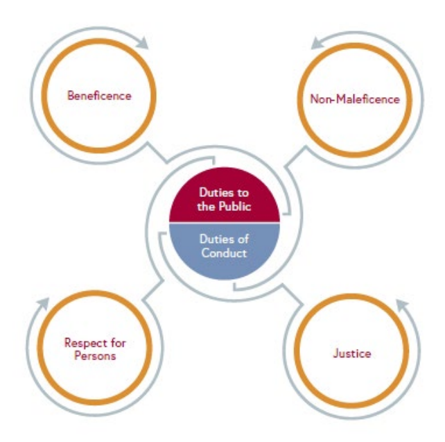
Figure 2: Code of Ethics Infographic

Pharmacy professionals have a duty to promote and protect the well-being, safety and interest of the public. Provision of OAT aligns with this duty. Pharmacy professionals are expected to take action to provide safe and effective care involving OAT to their patients. The four bioethical principles apply to the provision of OAT.